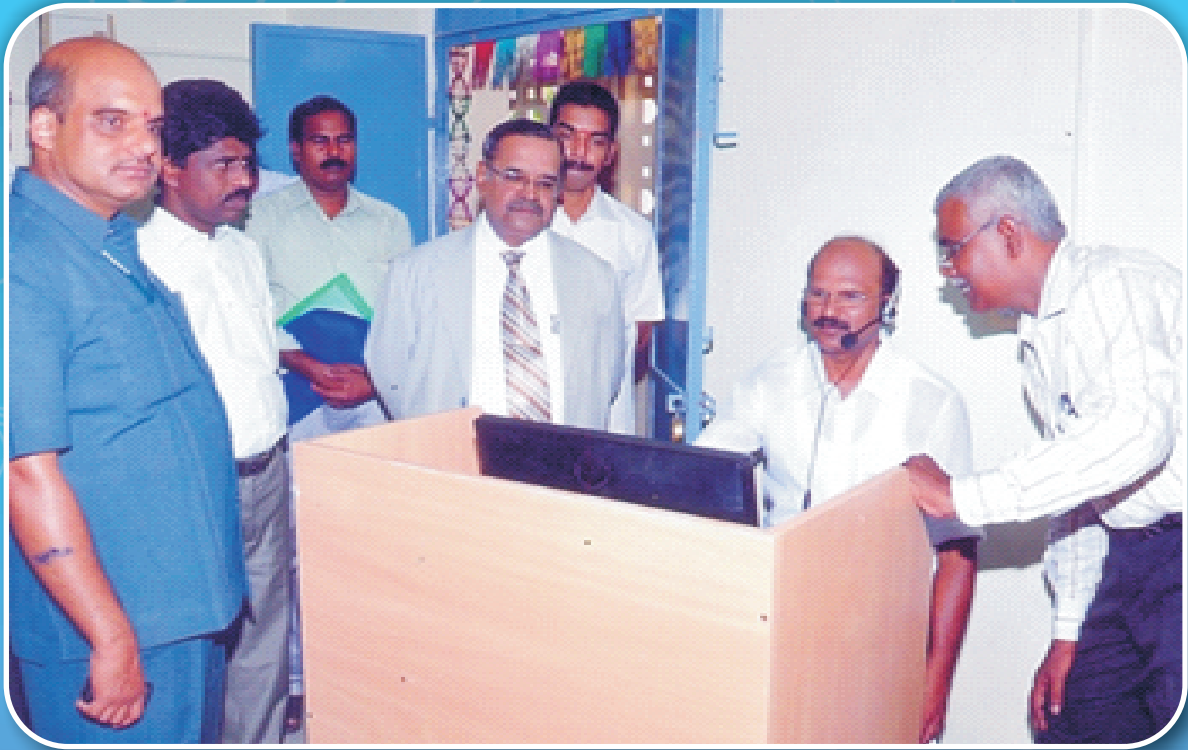
Honourable Minister sharing his jubilation in the Foreign Language Laboratory