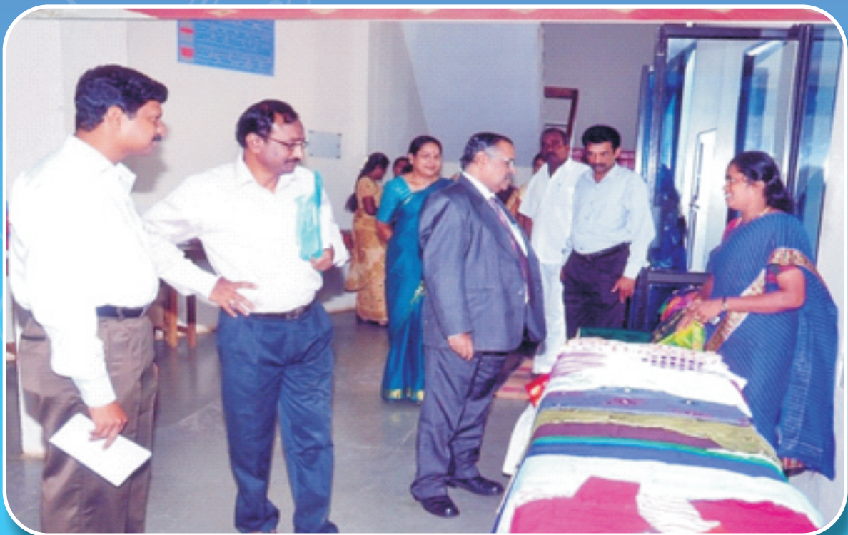
Trades of Aari work and Glass Painting - Display