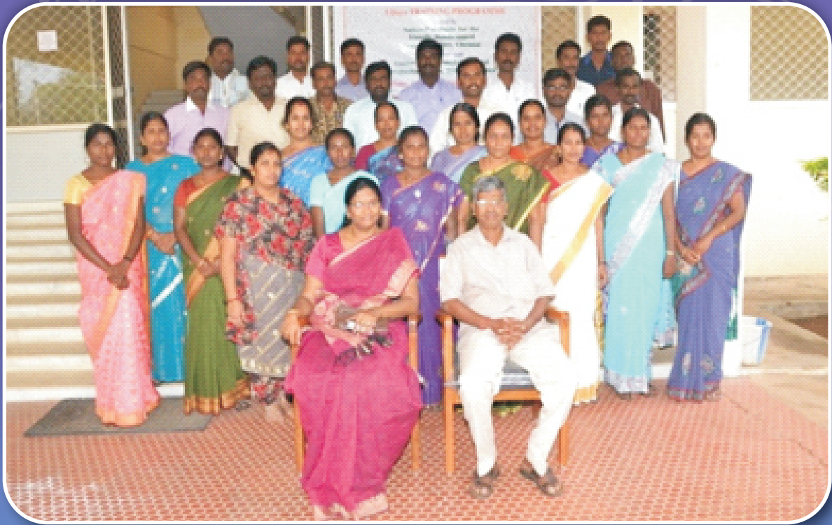
Orientation Programme to the Visually Impaired